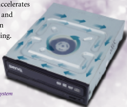
BenQ Dual Cooling System

The BenQ exclusive Dual Cooling System(DCS) features Anti-Dust Cooling System(ADCS) and Air Flow Cooling System(AFCs) to effectively reduce the potential for over-heating during high-speed reading and writing. With an integrated heat chimney design, ADCS redirects the heat flow out of the drive and still provides for protection from dust. AFCs accelerates the circulation inside the drive and speeds up the heat elimination through the drive's steel housing.