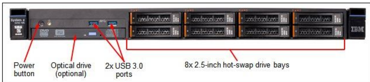
Figure 2. Front view of the IBM System x3250 M5 with eight 2.5-inch hot-swap drive bays

The following figure shows the front of the server with eight 2.5-inch hot-swap drive bays (models with 2.5-inch simple-swap or 3.5-inch simple-swap or hot-swap drive bays are also available).