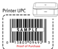
Sample Printer 12-Digit UPC Barcode