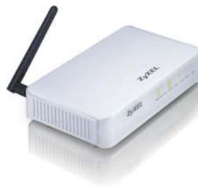
802.11g Wireless Internet Sharing Router P-330W