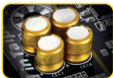
High Quality Audio Capacitors