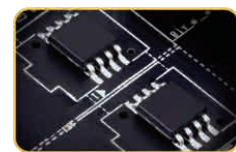
GIGABYTE Patented DualBIOS™ (UEFI) Design