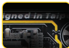
Dedicated Audio Hardware Zone