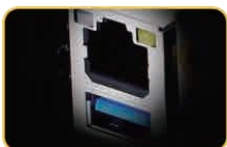
ESD Protection for USB and LAN