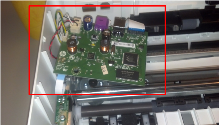
Figure 3: Gently pull out all internal wires