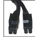
2X 4+4 Pin EPS12V