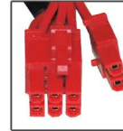
6X 6+2 Pin PCI-E