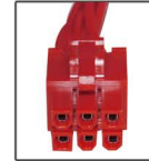
2X 6 Pin PCI-E