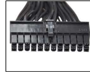
1X 24 Pin ATX

EVGA has gone Platinum with the new SuperNOVA 1000 P2 Power Supply! This Power supply is 80 PLUS® Platinum rated with an efficiency of 92% under typical loads. The new ECO Thermal Control Fan System offers Fan RPM modes to provide zero fan noise during low load operations. This provides improved efficiency for longer operation, less power consumption, reduced energy costs and minimal heat dissipation. Backed by a 10year warranty, gain peace of mind from the heart of your system and power up with the EVGA SuperNOVA 1000 P2!