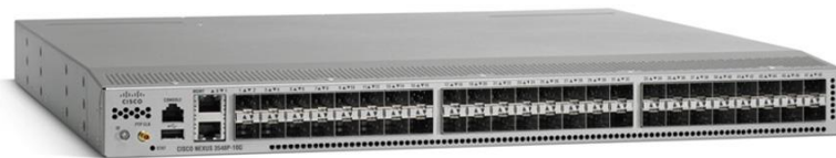
Figure 1. Cisco Nexus 3548 Switch

The Cisco Nexus 3548 has the following hardware configuration: