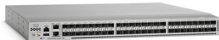
Figure 4. Cisco Nexus 3524 Switch

The Cisco Nexus 3524 has the following hardware configuration: