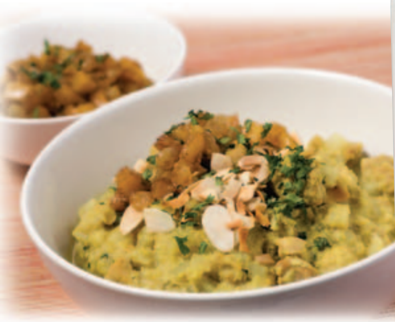
Spicy Mango Chutney