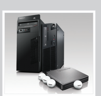
COMPACT DEISGN The M73 offers three different form factors—Mini Tower, Small Form Factor (SFF), and Tiny—without compromising on performance