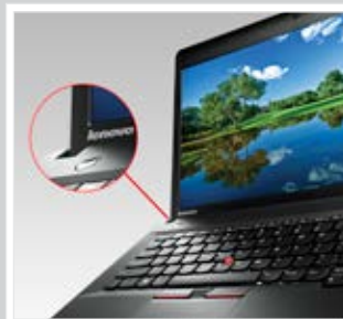
Hinges Drop-down hinges for improved strength and style

The full-featured Lenovo ThinkPad® Edge E545 laptop delivers smooth functionality and great performance. The new AMD® A-Series APU offers faster computing, while integrated AMD Radeon™ HD graphics bring onscreen images to life. Experience enhanced VoIP communication with the HD webcam and echo-cancellation dual array microphones. With the E545, experience a whole new level of productivity.