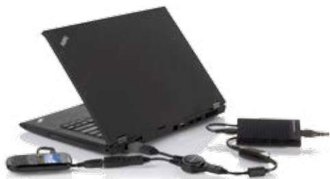
Lenovo 90W Ultraslim AC/DC Combo Adapter (41R4493)