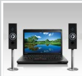
VoIP and Media Dual array microphones and Dolby® Advanced Audio v2 provide a truly lifelike audio experience