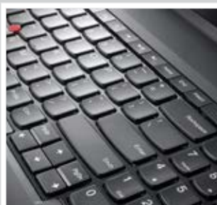
ThinkPad® Keyboard Legendary ThinkPad® keyboard design, with numeric keypad 1 and spill resistance