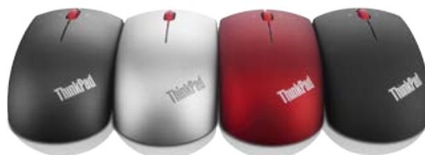
Precision Wireless Mouse (0B47161-8)