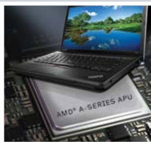
Processor New generation AMD® A-Series APU