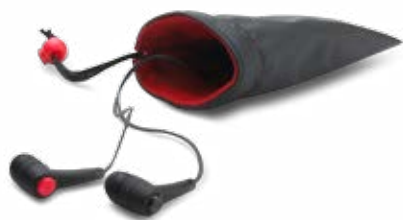
ThinkPad® In-ear Headphones (57Y4488)