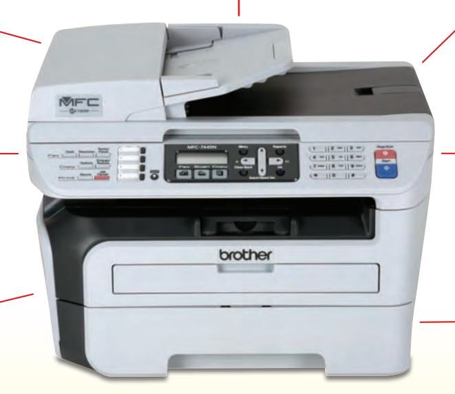
Flatbed Copying & Scanning Convenient for walk-up copying and scanning