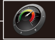
DPI ON THE FLY