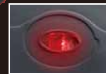
ANTI-DRIFT CONTROL SENSOR