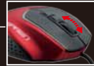
JAPANESE-MADE ULTRA-STEP WHEEL ENCODER