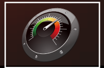
DPI ON THE FLY