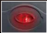
ANTI-DRIFT CONTROL SENSOR