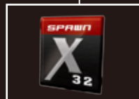
ONBOARD SENTINEL-X™ 32KB