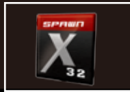
ONBOARD SENTINEL-X 32KB