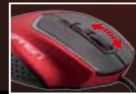
JAPANESE-MADE ULTRA-STEP WHEEL ENCODER