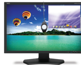
PA242W with picture in picture