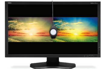
PA271W with picture by picture