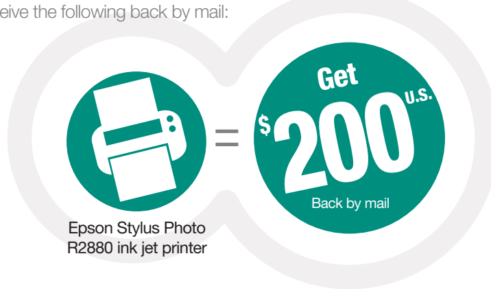
Epson Stylus Photo R2880 ink jet printer

Buy an Epson Stylus® Photo R2880 ink jet printer and receive the following back by mail: