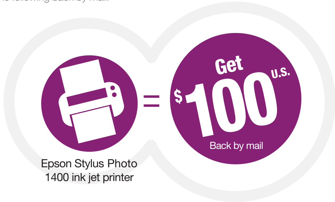
Epson Stylus Photo 1400 ink jet printer

Buy an Epson Stylus ® Photo 1400 ink jet printer and receive the following back by mail: