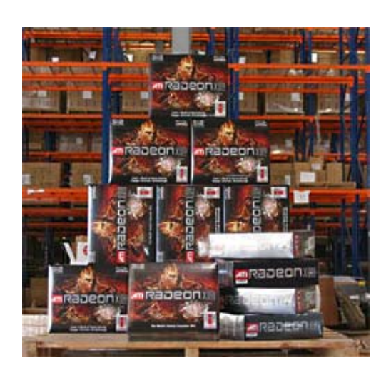
ATI X1900 boxes

processors, up from the X1800's 16. The new high-end option X1900 XTX increases the X1800 XT's core clock from 625 to 650 MHz, while memory speed is increased from 1.5 to 1.55 MHz. ATI claims that a 3x increase in shader units results in "rich, vibrant scenes" and "brings games to life." Compared to "the nearest competitor," ATI promises that games will runs up to 60% faster.