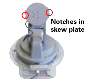
FIGURE 1. Anchor posts and notches to align