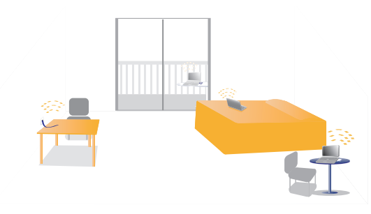
Multi user mode allows mutiple users to share one internet connection.