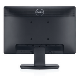
Back view (E1913)