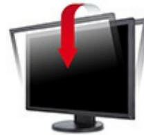
Tilt : -5 ~ 37 degrees

With advanced ergonomic features, ViewSonic displays are designed to provide a greater range of adjustment for increased productivity and comfort. Users can reduce eyestrain and physical fatigue by adjusting the monitor via 360-degree swivel, 90-degree pivot, -5 to 37-degree tilt, and 100mm height adjust options.