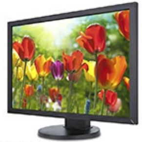
ViewSonic Flicker-Free Technology