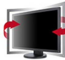
Swivel: 360 degrees