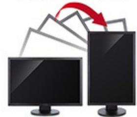
pivot: 90 degrees