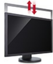
Height Adjust :0~100mm