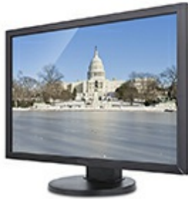
Dynamic Contrast Ratio