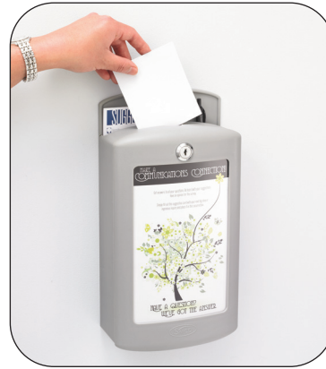
Wall mountable. Hardware included.