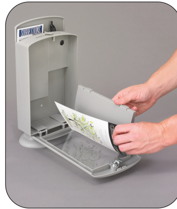
Front panel easily drops down to allow you to create a customized message.