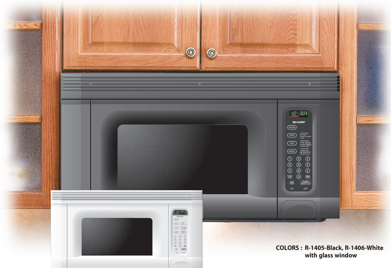
COLORS : R-1405-Black, R-1406-White with glass window