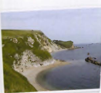
▲ Images from the NX1000 were brilliantly sharp and displayed a great deal of detail

“This may be just the kind of camera some may be seeking, especially as a second, more portable backup to their main kit”