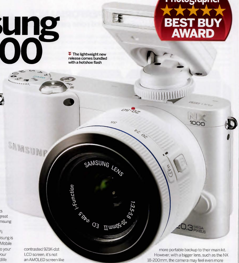
▼ The lightweight new release comes bundled with a hotshoe flash

Where the 'budget' nature of this CSC comes into play is in the construction. While it has a bright, well-