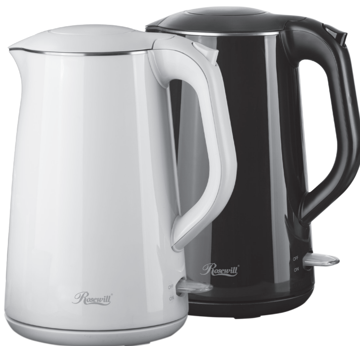
WATER KETTLE RHKT-15001 (white) RHKT-15002 (black)