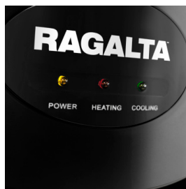
LED Status Indicator