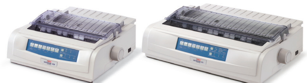
Narrow-carriage (ML420 and ML490)