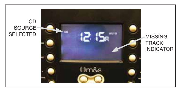
Figure 1. Master Unit Not Recognizing CD Unit