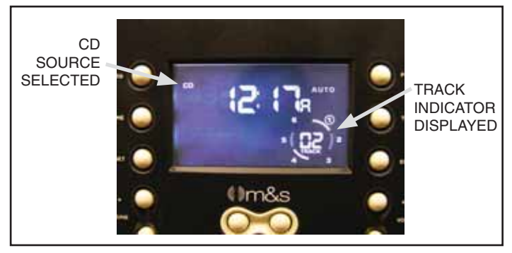
Figure 4. Master Unit CDTrack Indicator Display