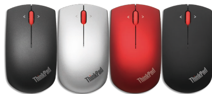
ThinkPad Precision Wireless Mouse - Midnight Black 0B47163, ThinkPad Precision Wireless Mouse - Heatwave Red 0B47165, ThinkPad Precision Wireless Mouse - Frost Silver 0B47167, ThinkPad Precision Wireless Mouse - Graphite Black 0B47168, ThinkPad Precision USB Mouse - Midnight Black 0B47153