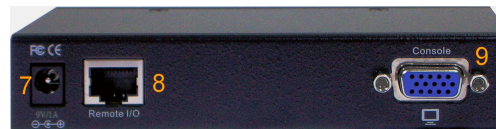
[LKV-E132-RX - Front-panel]

Applicable models: LKV-E132 CAT5 KVM Extender Set