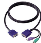
Slim 3-in-1 KVM combo cable