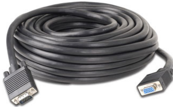
Ultra-Hi-Grade VGA Cable 50 feet (G2LVGAE050) Ultra-Hi-Grade VGA Cable 50 feet