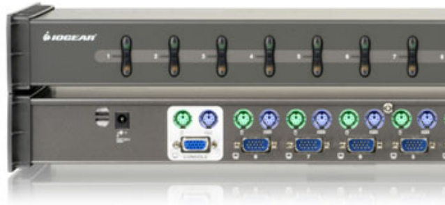
8-Port MiniView™ Ultra KVM Switch (GCS138) 8-Port PS/2 KVM with On Screen Display