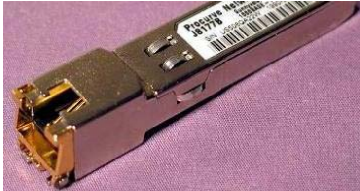
Figure 1. Latch in locked position