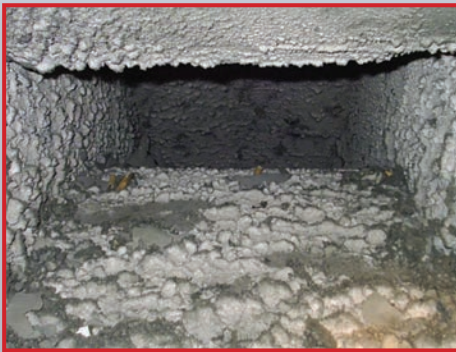
A probe's-eye view of a filthy air-conditioning duct