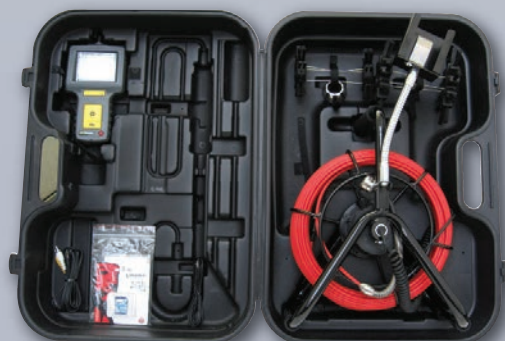
A packaged DPS16 system