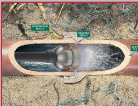
Tree roots cracking and invading a clay sewer pipe