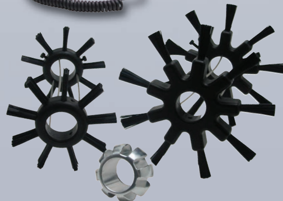
2, 4 and 6 in. probe centering accessories