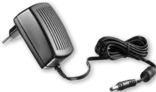
AC Adapter Run or recharge your Rhino™ from a mains socket.