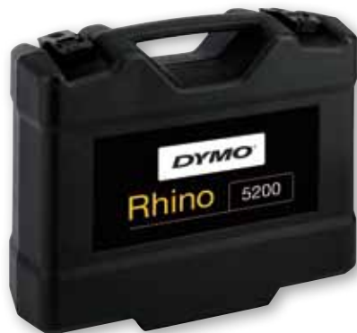
Rhino™ 5200 Hard Carry Case Store and protect your Rhino™.