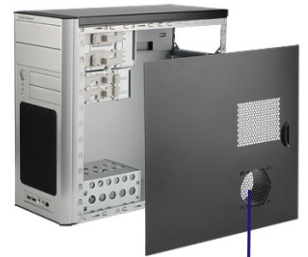
Chassis Air Guide V1.1 (compatible with 8cm fan)