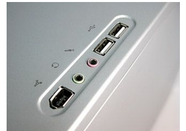
Dual USB2.0, IEEE1394 Audio & speaker ports