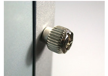
Thumb-screws for easy open side panel