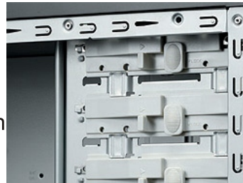
Tool-less installation for 5.25" devices