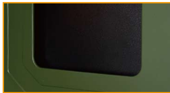
Huge hole for easy accessing the backplate of the CPU cooler