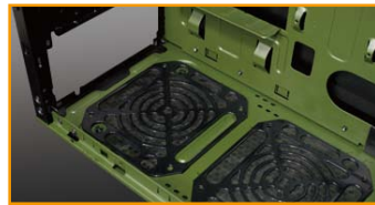
Air filters x2 for the power supply fan & 120mm fan