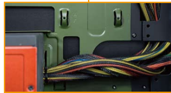
Cable routing management for easy routing and hiding cables