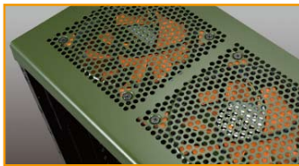
Top cover can install 2pcs 120mm fans for better airflow(Optional)