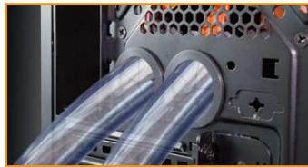
Holes for water cooling solution