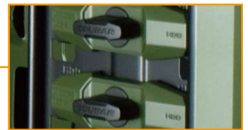
HDD Screw-less devices