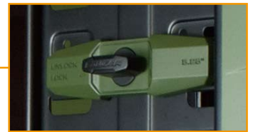
5.25" Screw-less devices