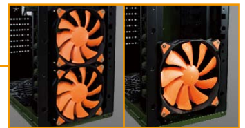
Front can install 2pcs 120mm fans or 1pcs 140mm fan for better airflow(Optional)