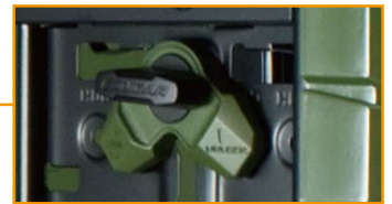
3.5" Screw-less device