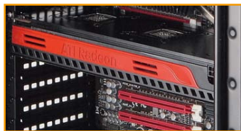
Support for long VGA card up to 320mm