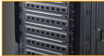
Vented slot covers for better airflow