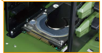
Support 2.5" HDD/SSD at bottom