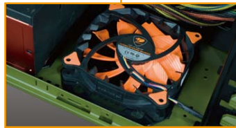
Bottom cover can install 1pcs 120mm fan for better airflow (Optional)