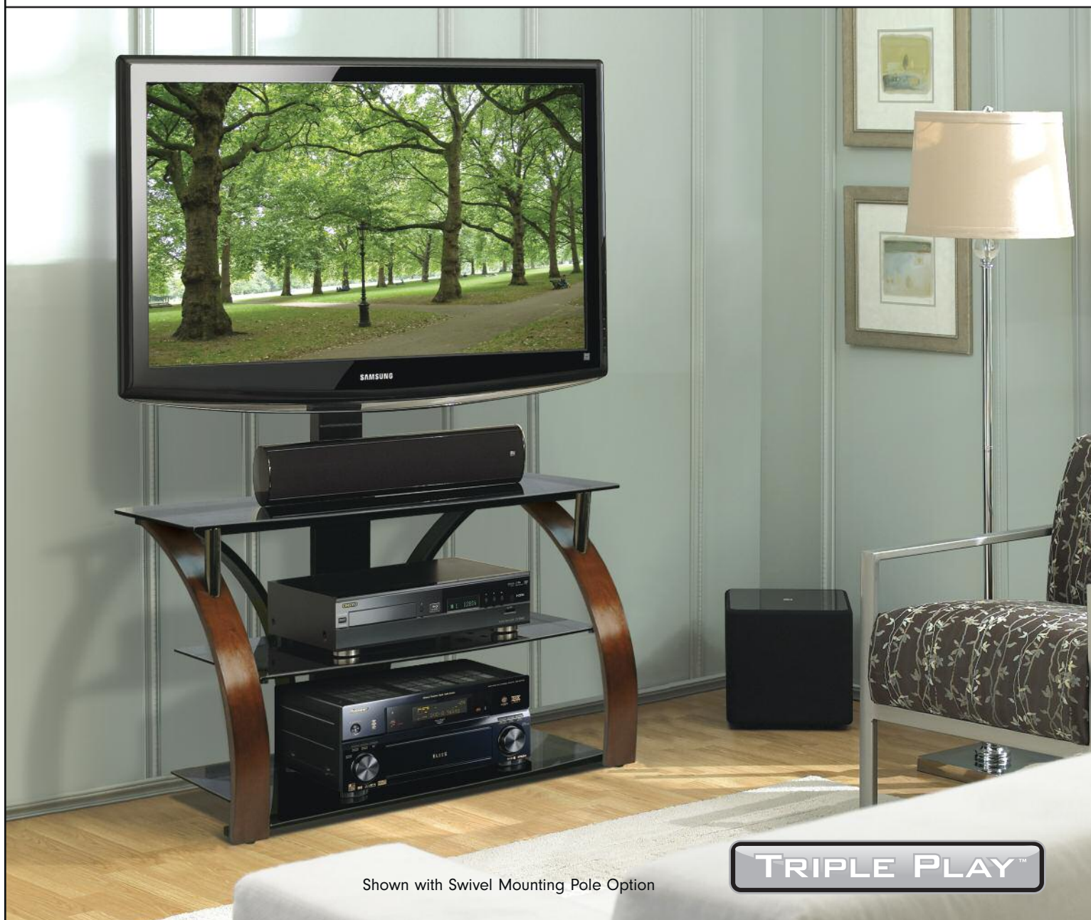
Shown with Swivel Mounting Pole Option