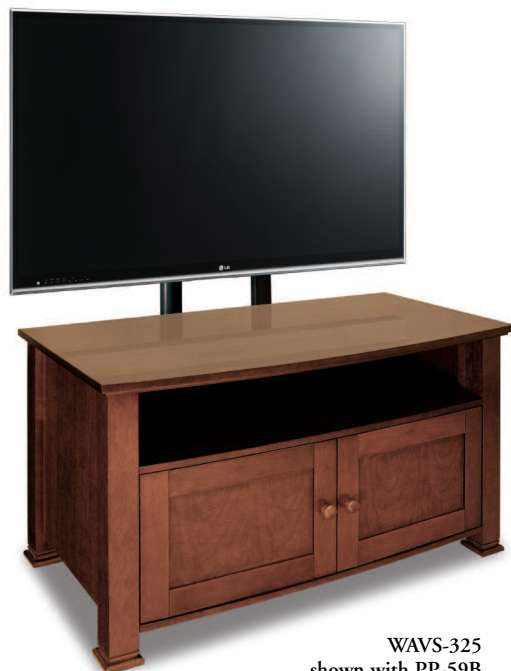
WAVS-325 shown with PP-59B