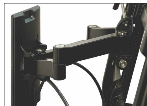
Built-in Cable Management System