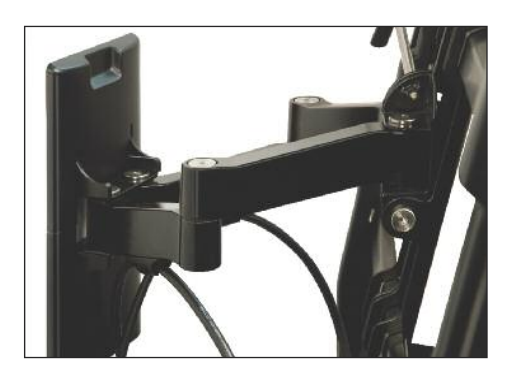
Built-in Cable Management System