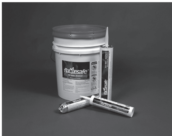
FlameSafe FS 900+ Sealant

FS 900+ can be used in various penetrations and construction/architectural joint configurations. Examples of listed systems include metallic and non-metallic pipes, cable and HVAC penetrations, concrete floor-to-floor, floor-to-wall and wall-to-wall applications, as well as for concrete, CMU and gypsum head of wall applications requiring dynamic joint movement. FS 900+ is a versatile, yet economical solution for a wide range of through-penetration and joint construction conditions.