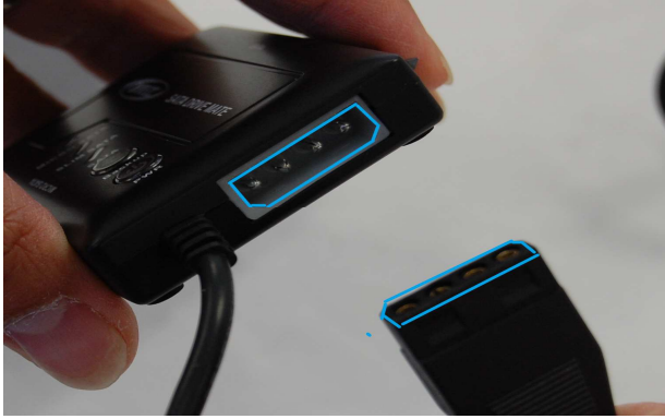
1: Match the power pin connector