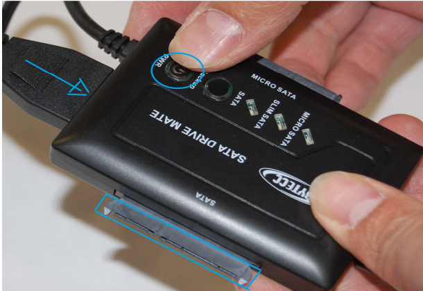
3: Press power button to power ON