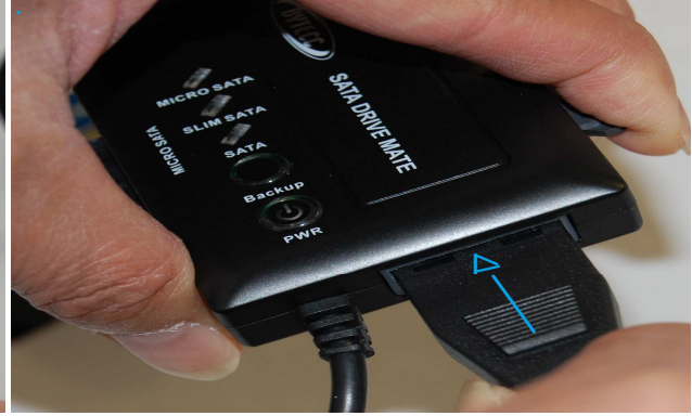
2: Connect power connector to BT-370