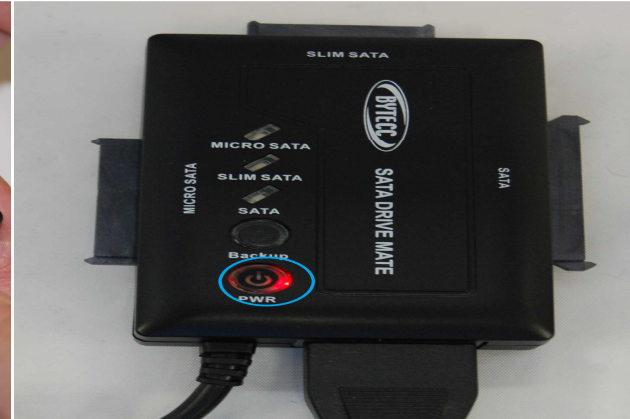
4: Red LED light should light up like this