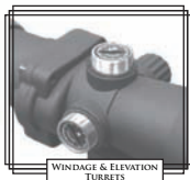
WINDAGE & ELEVATION TURRETS

Turn the turret counter clockwise to make the reticle move to the right. Turn the turret clockwise to make the reticle move to the left.