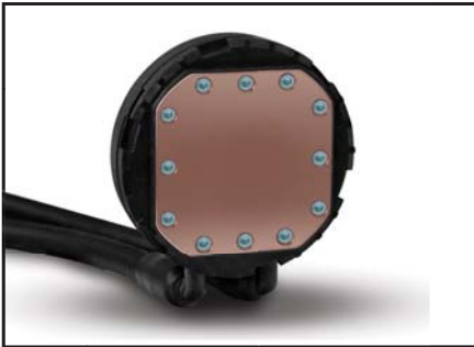
Copper cold plate is optimized for thermal conduction