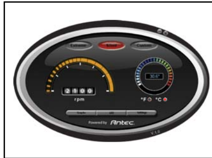
Included software provides essential tools to control and monitor the KÜHLER H 2 O 950