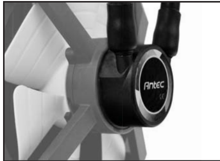
Extra large pump and integrated fan were engineered to cool the radiator efficiently