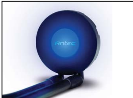
RGB LED illuminates your case and changes color to indicate CPU temperature