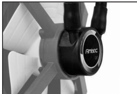
Extra large pump and integrated PWM fan were engineered to cool the radiator efficiently