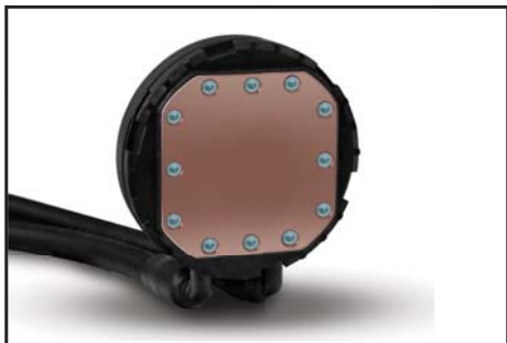
Copper cold plate is optimized for thermal conduction