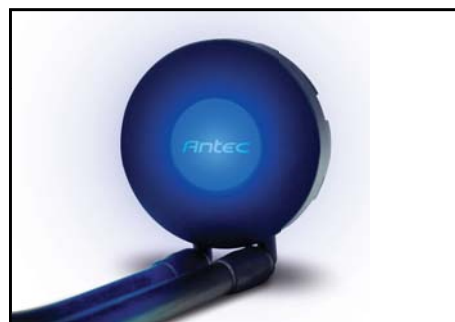
RGB LED illuminates your case and changes color to indicate CPU temperature