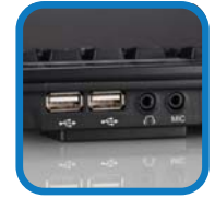
Integrated USB hubs and audio/mic