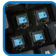
Mechanical Key Switch

The integrated hi-speed USB 2.0 hub provides a 480 Mbps data transfer rate and 500mA power current, ideal for USB mobile devices, such as a mouse, trackball, joystick, flash drive, digital camera, iPod, iPhone, MP3 Player and more. The integrated audio and microphone jack provide convenience for inserting a headset or microphone device, and clears up valuable desk space.