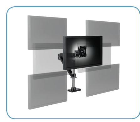
Highly adjustable arm