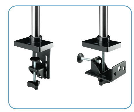
Clamp and grommet mount on desk mount model